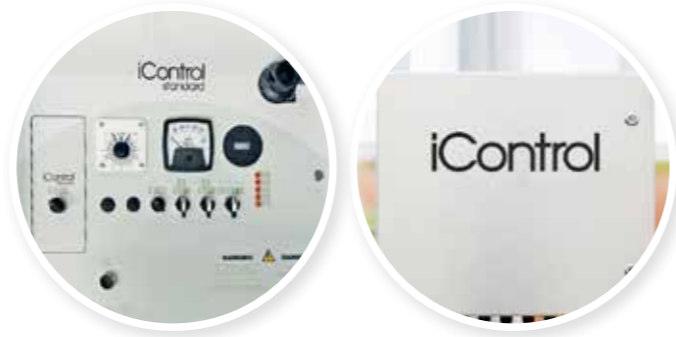
Each panel is housed in a stainless-steel enclosure.